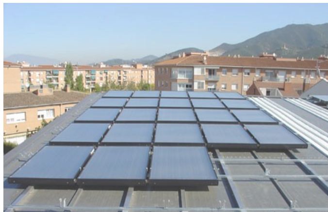
Energy Usage in Commercial Buildings

Solar systems qualify for Federal tax incentives valued at 30% of the cost of each system with no limits!